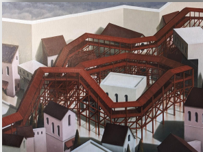
Adam Stoner Plaza With Red Bridge Oil on birch panel 18x24 - $2,200