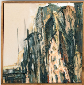
Reagan Mulvey Facade Acrylic, acrylic latex caulk, sand & crayon on canvas 20x20 - $450