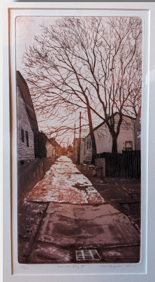
Todd Mrozinski Riverwest Alley 2 Etching & aquatint 12x6 - $425