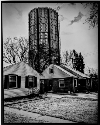
Jeff Cartier Tower 1 Digital photograph 16.5x13 - $250