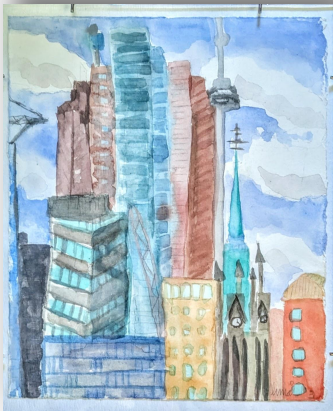
Renee Luna Bebeau CN Tower, Toronto watercolor on paper 10x7 - $150