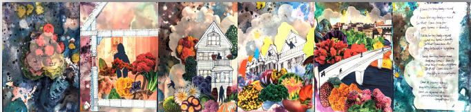
Chelsea Wait Scales of Care Watercolor, collage, drawing 9x42 - $660