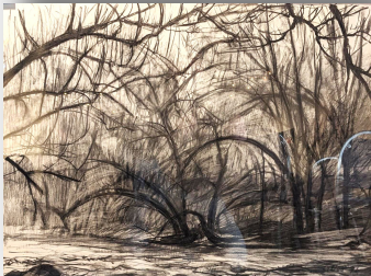
Michael Olive Past Arches Charcoal on paper 33x27 - $225