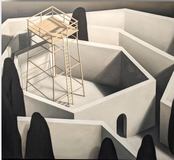
Adam Stoner The Oracle Oil on canvas 36x40 - $3,000