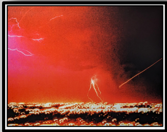
Jeff Cartier Indian Boundary Park Digital print from 35mm Ektachrome reversal slide 13x16.5 - $250