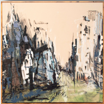
Reagan Mulvey Crossroads Acrylic, acrylic latex caulk, sand & crayon on canvas 48x48 - $1,750